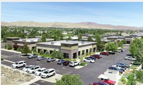
VINEYARD PROFESSIONAL CAMPUS - 87,000 SF OFFICE / MEDICAL