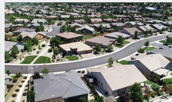
THE VINEYARDS - 307 HOME COMMUNITY