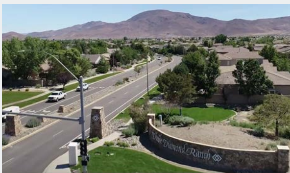
DOUBLE DIAMOND RANCH 3,000 HOME MASTER PLANNED COMMUNITY