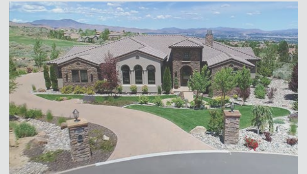
ARROWCREEK CUSTOM HOME DESIGNED / DEVELOPED & BUILT BY TANAMERA