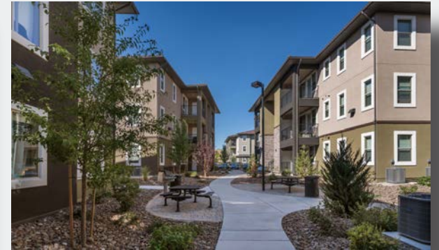
THE VINEYARDS APTS - 210 UNITS