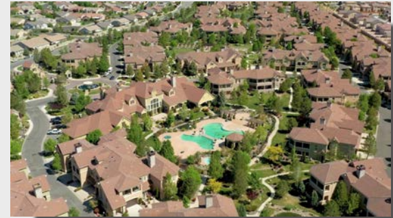
Fleur De Lis 370 Unit Class "A" Condominium Community