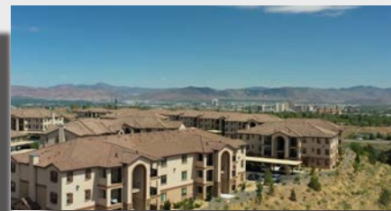
The Villas @ Keystone Canyon Apartments