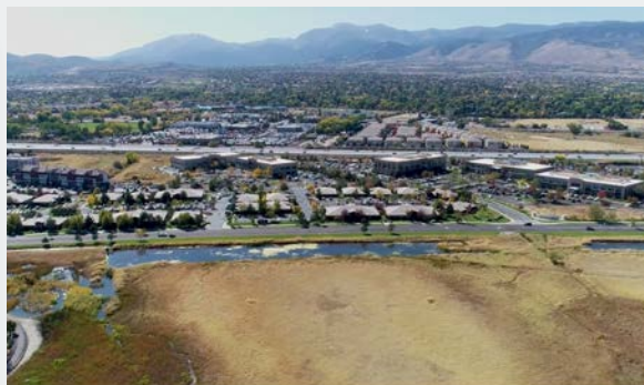
RENO TAHOE TECH CENTER - 512,997 SF OFFICE / MEDICAL