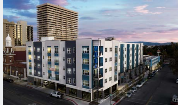
MOD 2 APTS - 69 UNITS