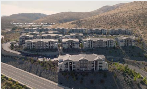
CARSON HILLS APTS - 370 UNITS