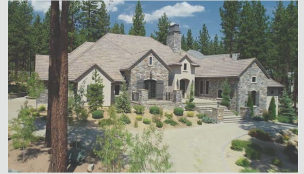
MONTREUX CUSTOM HOME DESIGNED / DEVELOPED & BUILT BY TANAMERA