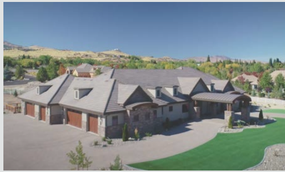
SOUTH RENO CUSTOM HOME DESIGNED & BUILT BY TANAMERA