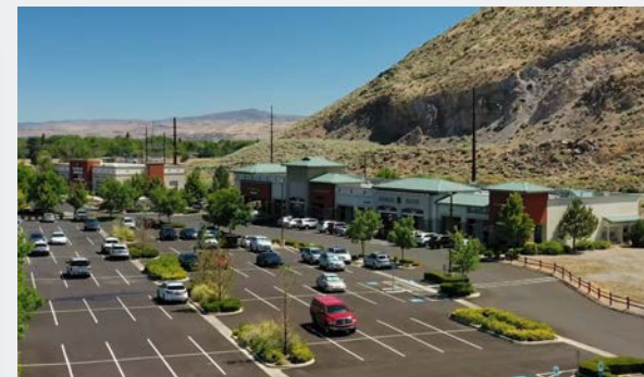
LONGLEY TOWN CENTRE - 100,000 SF RETAIL