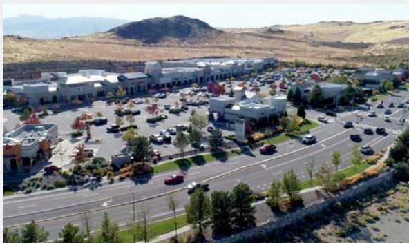
SPARKS GALLERIA - 473,043 SF RETAIL