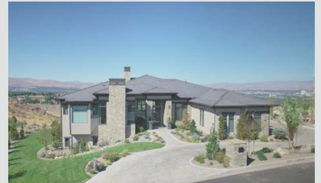
CAUGHLIN RANCH CUSTOM HOME DESIGNED & BUILT BY TANAMERA