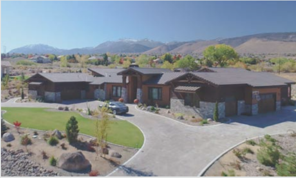
SOUTH RENO CUSTOM HOME DESIGNED & BUILT BY TANAMERA