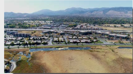
Reno Tahoe Tech Center 500,000 SF Office / Medical Office Park