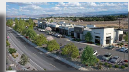
Keystone Canyon Towne Center

KEYSTONE CANYON PLANNED UNIT DEVELOPMENT 745 Class "A" Multifamily Units (3 Projects) & An 18,000 SF Community Shopping Center Overlooking Down Town Reno