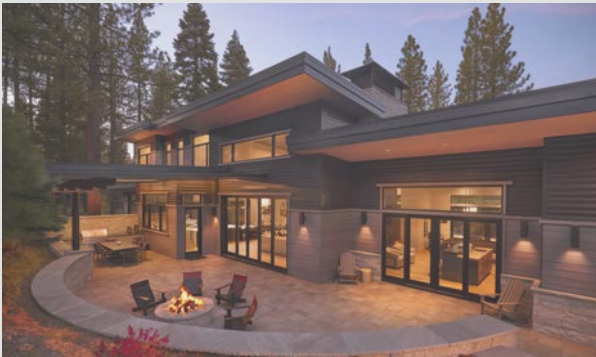
MARTIS CAMP CUSTOM HOME DESIGNED & BUILT BY TANAMERA