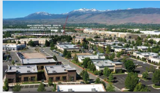
Reno Corporate Center 369,370 SF Office / Medical Office Park