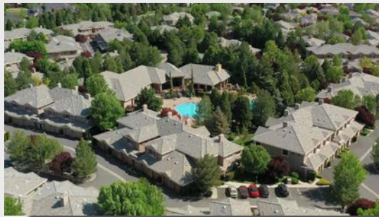
Tanamera Apartments 440 Unit Class "A" Apartment Community