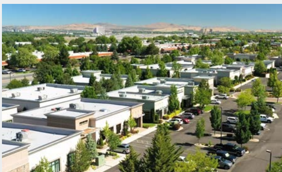
RENO CORPORATE CENTER - 430,000 SF OFFICE / MEDICAL