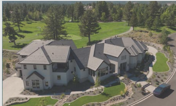
MONTREUX CUSTOM HOME DESIGNED / DEVELOPED & BUILT BY TANAMERA