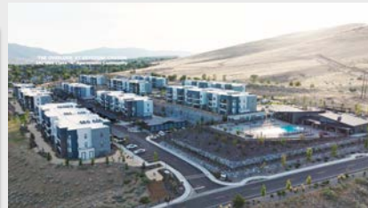
The Overlook @ Keystone Canyon Apartments