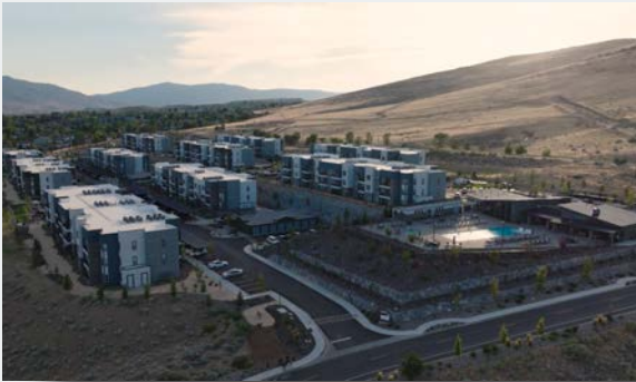
THE OVERLOOK APTS - 342 UNITS