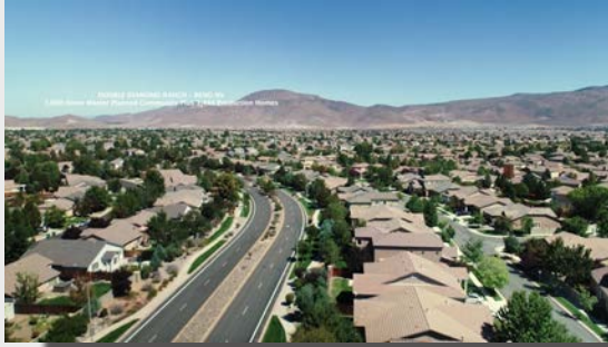
Double Diamond Ranch 3,000 Home Master Planned Community