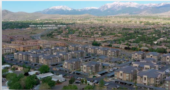
SIERRA VISTA APTS - 336 UNITS