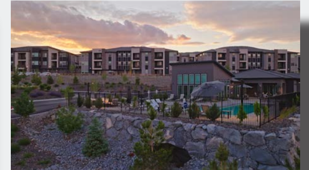
TRAILHEAD CONDOS - 115 UNITS