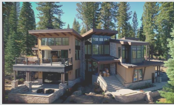
SCHAFFER'S MILL CUSTOM HOME DESIGNED & BUILT BY TANAMERA