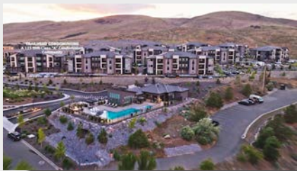
Trail Head Condominiums @ Keystone Canyon