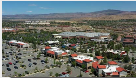
Sparks Galleria 72 Acre Regional Shopping Center Costco / Home Depot Anchored