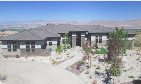
ARROWCREEK CUSTOM HOME DESIGNED / DEVELOPED & BUILT BY TANAMERA