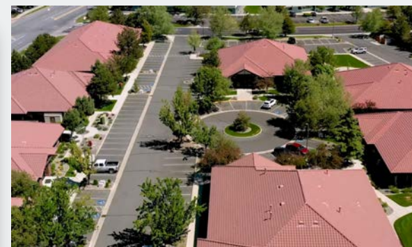
DOUBLE DIAMOND PROFESSIONAL - 120,000 SF OFFICE / MEDICAL